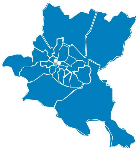
Sofia Municipality, Vazrazhdane Region