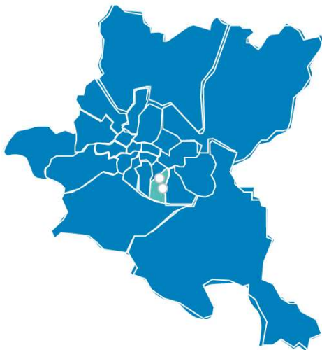
Sofia Municipality, Studentski Region

Middle – annual revenue under 50 million euro