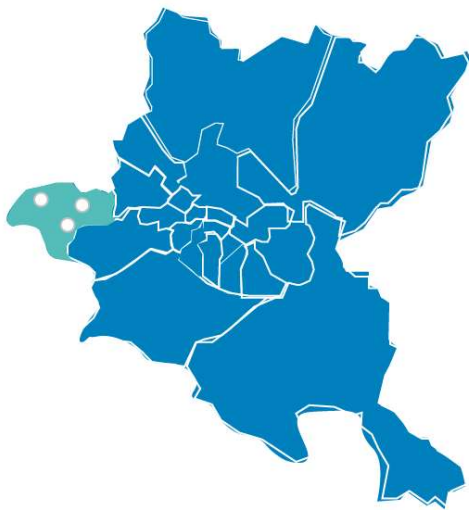
Sofia Municipality, Bankya Region

Middle – annual revenue under 50 million euro