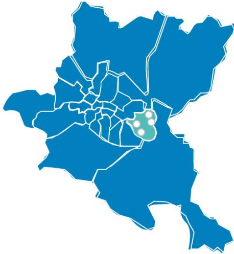
Sofia Municipality, Iskar Region

Very Large – annual revenue under 250 million euro